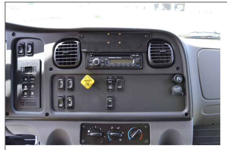
4. The ProClip Mount is in place.

3. Reinsert the screws into the holes they were removed from and tighten the screws.